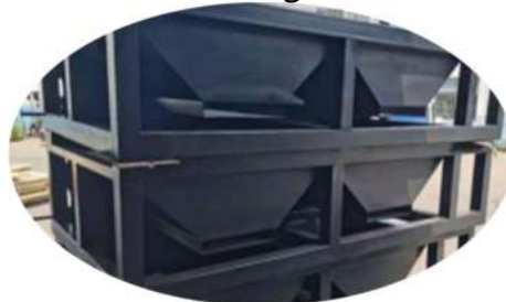
High strength integrated bed