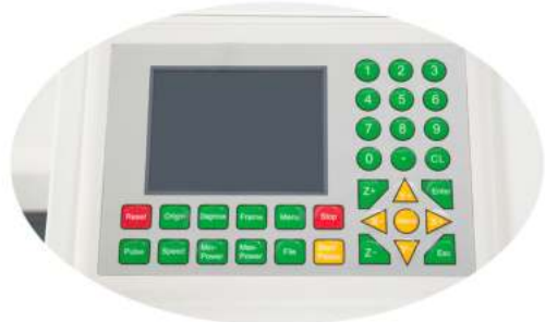
Ruida Control panel