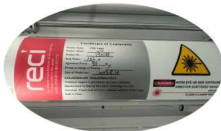
RECI brand wiht best in China