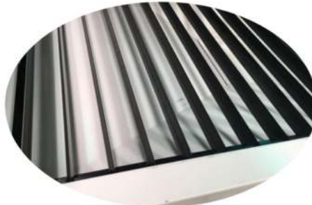
Blade/Honeycomb working table